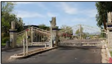
48th Street Gate

Our community has a gate on 48 th St. at its North entrance, and residents must enter a code into the gate's keypad to open/close the gate or use the PSMRA key fob. The key fob is available for purchase at First Service Residential.