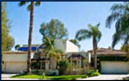
Gosnell Attached Garden Home

History: Our community is comprised of homes built by several different builders, with the units often referred to by the builder’s name.