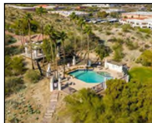
Vantage Pointe Pool

are allowed. Pets or glass items are always prohibited in the pool areas. When arriving and departing the pool area, residents are required to secure gates in a locked position. Propping gates open or tampering with the closing devices is prohibited.